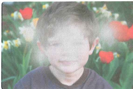
Blurry or dim vision