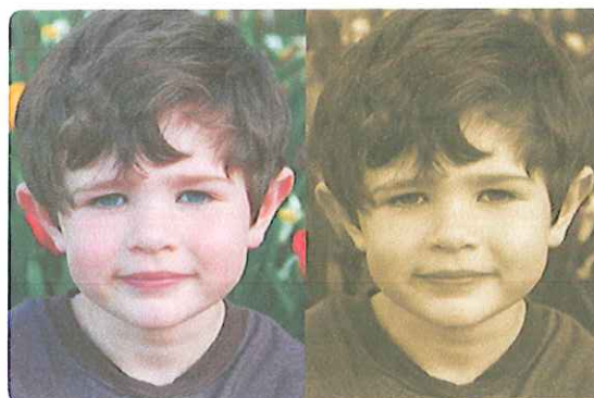
Left, normal vision. At right, dull or yellow vision.